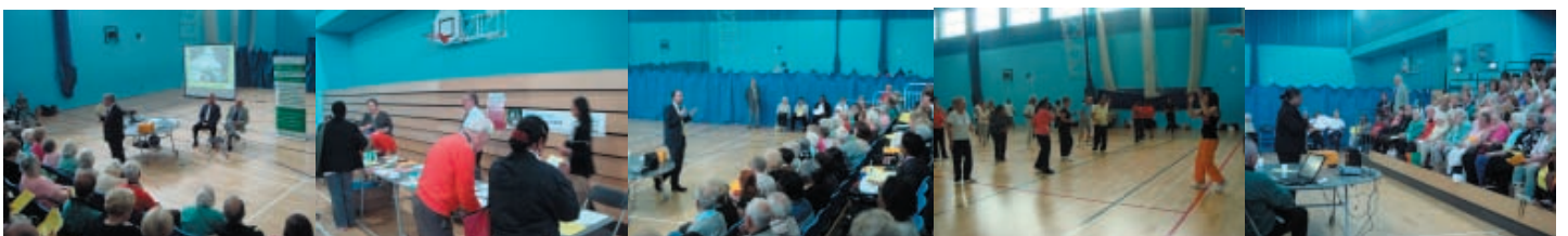
Two hundred older people attended a very successful 'Watch your step' Falls Awareness Day at Edmonton Leisure Centre on 20 June, run by the Forum staff and volunteers and supported by the local authority and other partners.