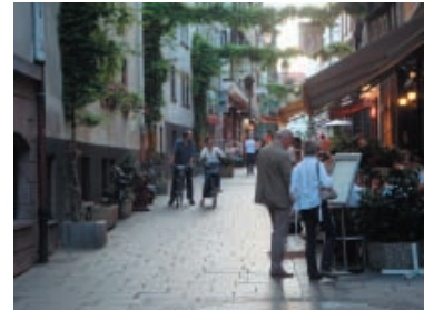
A Strasbourg street

“The European Year for Active Ageing presents a real opportunity to recognise and build upon the indispensable contribution that older people make to society as well as foster intergenerational solidarity. With determination and perseverance, we can ensure that 2012 leaves a lasting legacy of support for, and from, older people for years to come.”